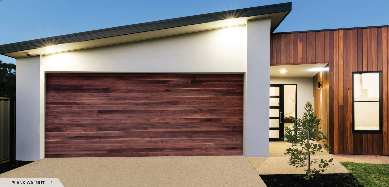
PLANK WALNUT ↑