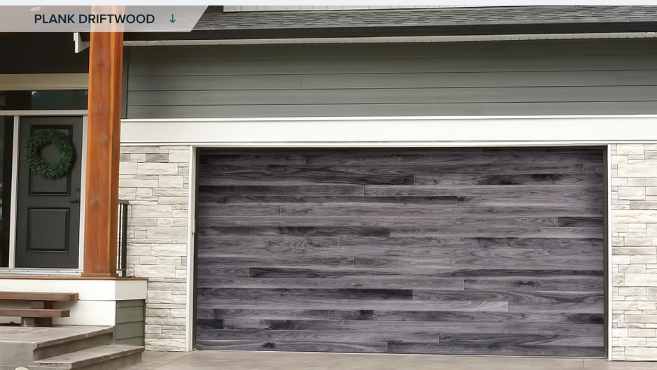
PLANK DRIFTWOOD ↓

View all the specs for this door online at doorLinkmfg.com