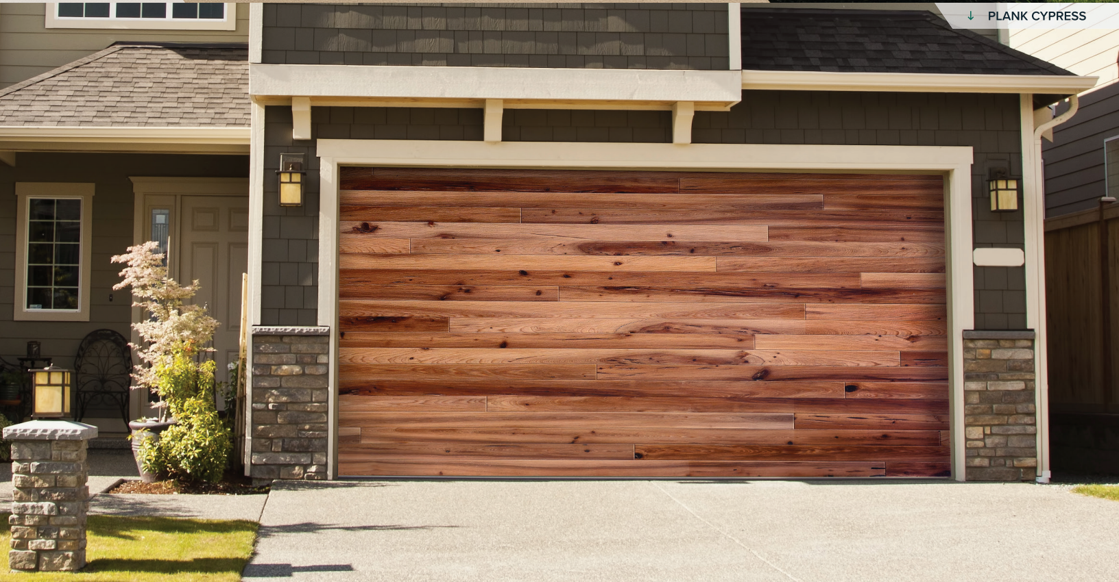
↓ PLANK CYPRESS